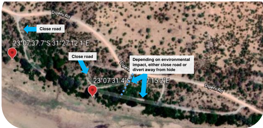
Figure 4. Proposed closure of loops for Shingwedzi Treehouse Camp site

To enable exclusive use of the Project Site, SANParks will allow for the Operator to close off the following loops, as demonstrated below. In return, the Operator is expected to develop the hide as a get-out point for the public. As per the image, during the environmental authorisation process, consideration must be given to whether part of the loop can be diverted or closed: