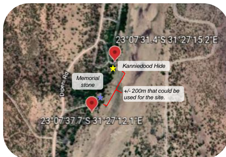
Figure 2. Shingwedzi Treehouse Camp site: Google Earth images of the location of the site