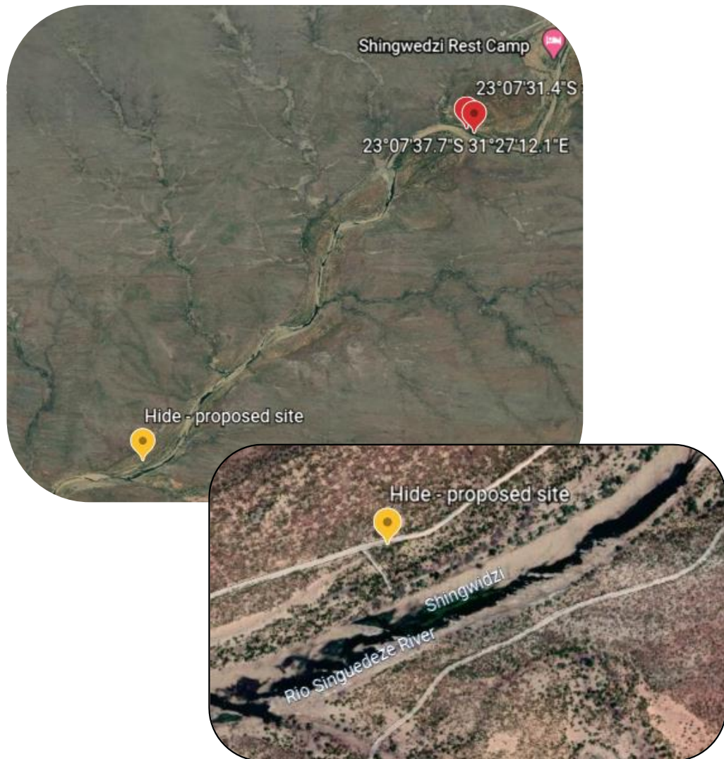
Figure 3. Proposed site for relocation of the Kanniedood Hide